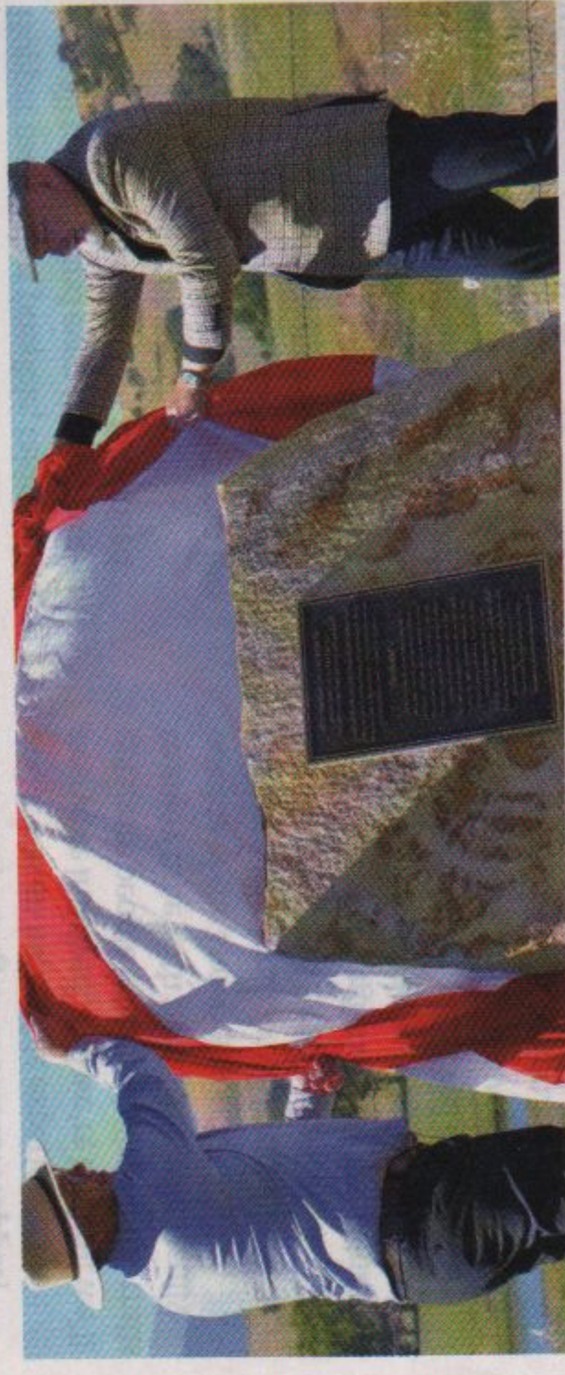
HISTORY: Unveiling the Strzelecki Memorial in Towong, and the Sir Paul Edmund Strzelecki statue in Jindabyne.