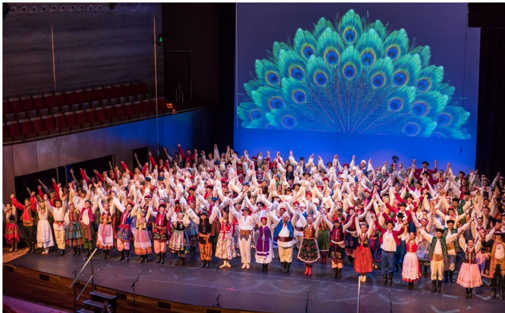
PolArt 2015 Melbourne Finale